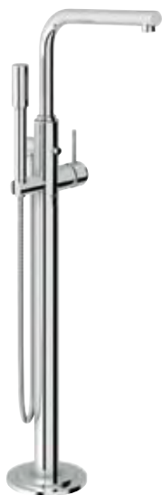
32 227 001 7° floorstanding tub filler 1* GROHE StarLight® chrome