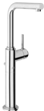
32 655 001 7° deck mount vessel GROHE StarLight® chrome also available in ENO