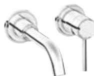
19 291 001 wall mount vessel trim 2 GROHE StarLight® chrome also available in ENO