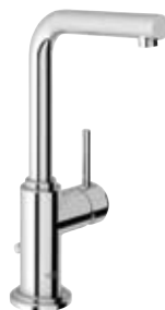
32 006 001 7° swivel spout lavatory centerset GROHE StarLight® chrome also available in ENO